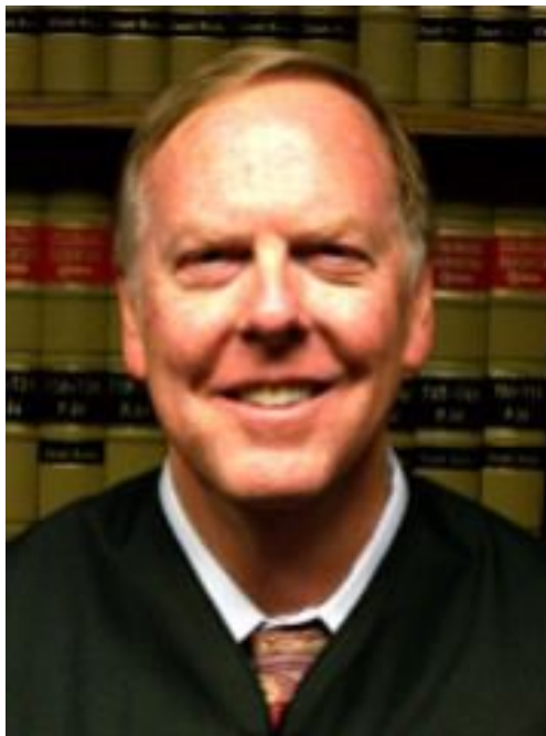
El Paso County Judge Douglas Miles oversees the domestic violence court.